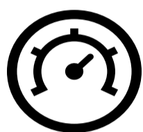
Increased blood pressure

When your kidneys aren't functioning properly, they don't filter out sodium, potentially leading to a number of additional health issues including: