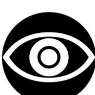
Puffiness around the eyes