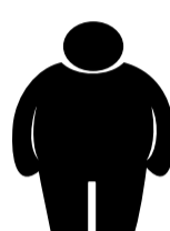
Weight gain from "water" weight